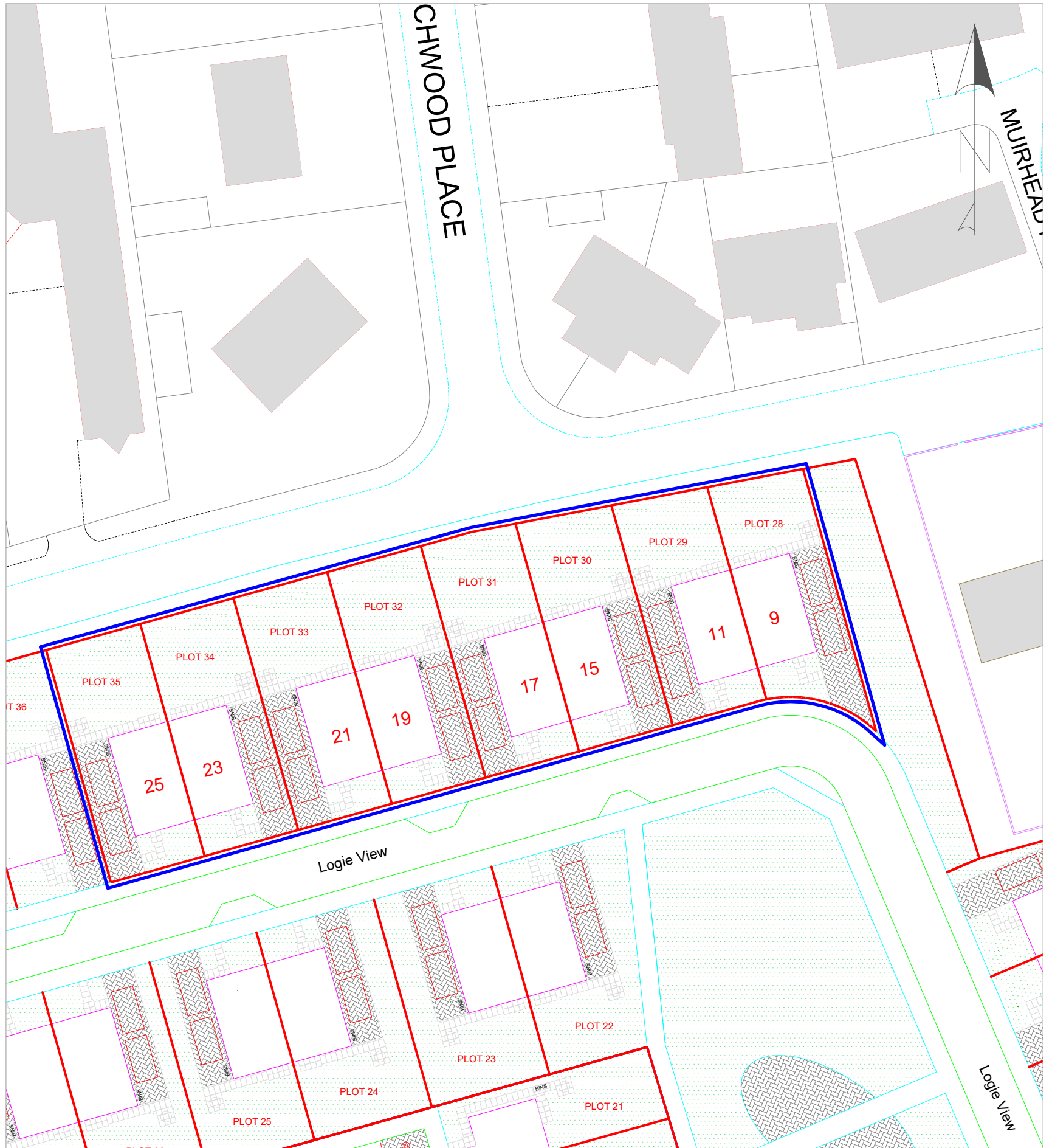
SITE PLAN | A3 | 1:500