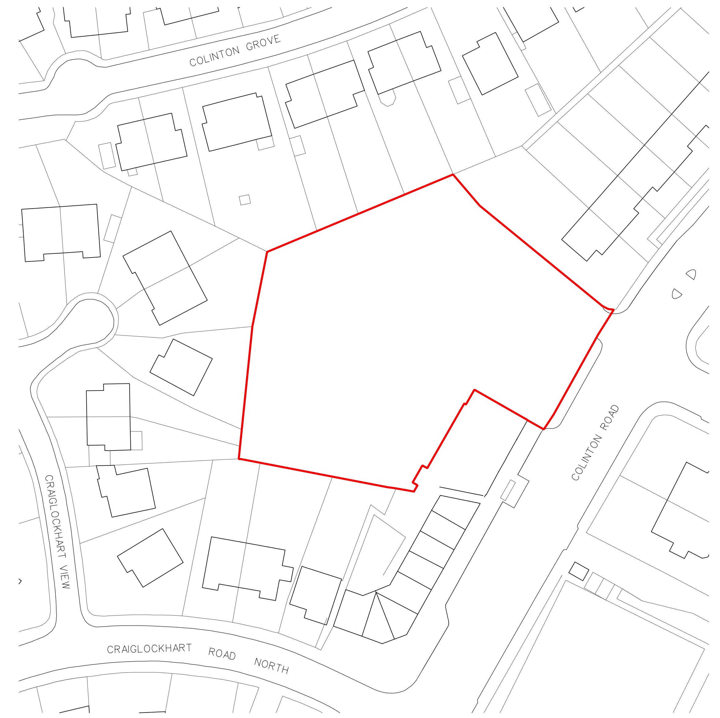
Site Location Plan 1:500

The development registered under title MID216687 and plots 1 to 21 within have been DPA approved by: