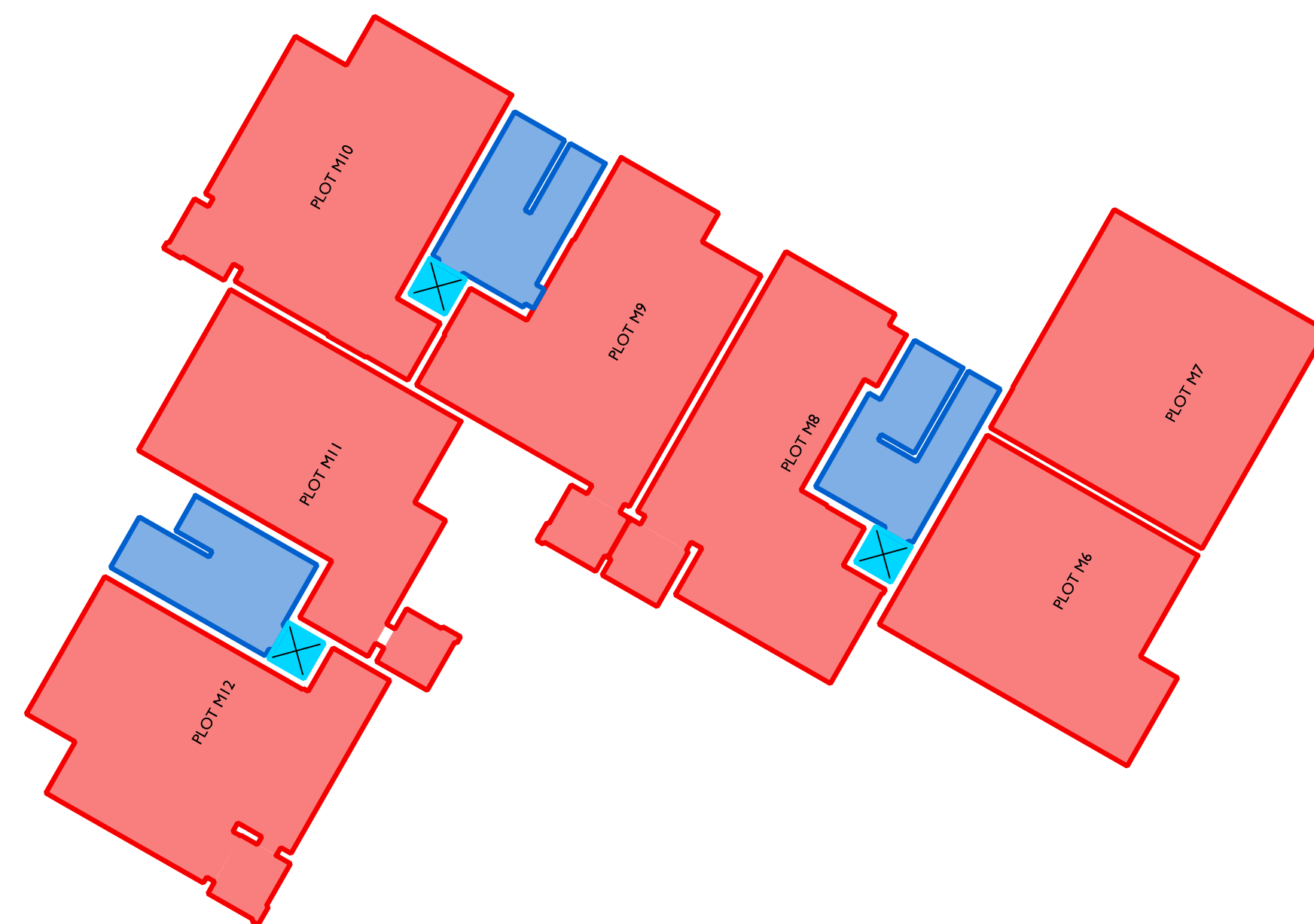
Ground Floor Plan 1:250