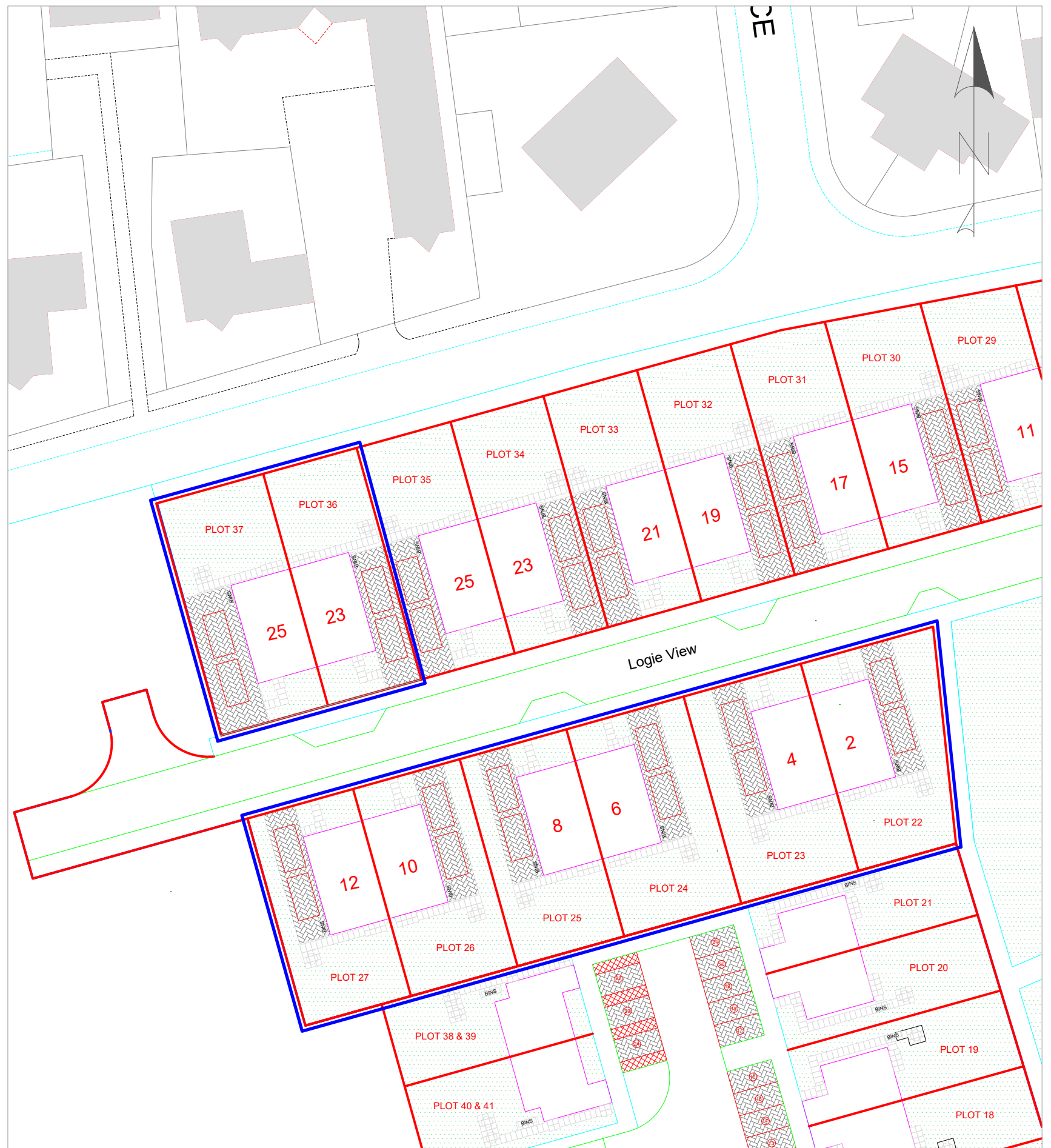
SITE PLAN | A3 | 1:500