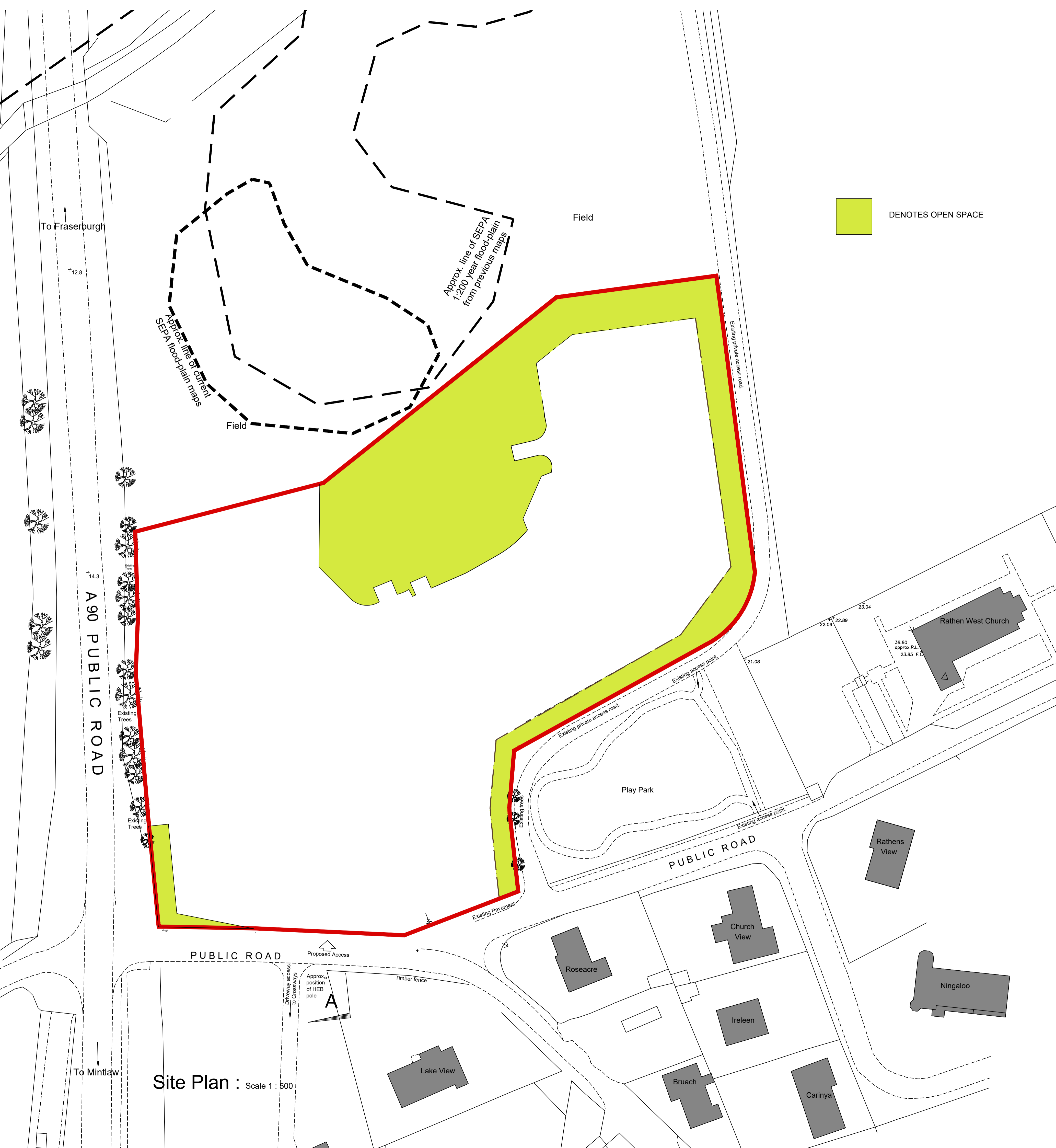
Site Plan : Scale 1 : 500